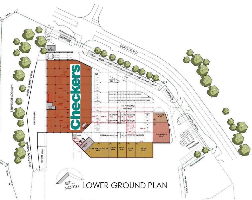
NORTH LOWER GROUND PLAN