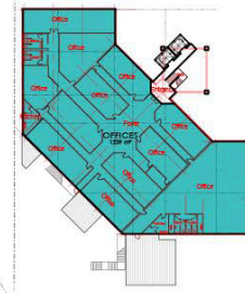
NORTH FIRST FLOOR PLAN